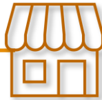
Regional/Locally Owned business