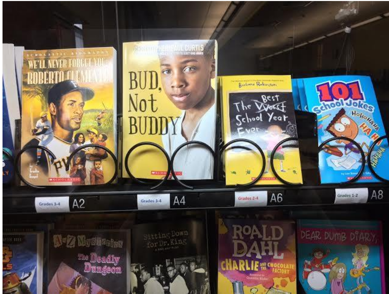
There are a variety of books in the vending machine for readers of all levels.